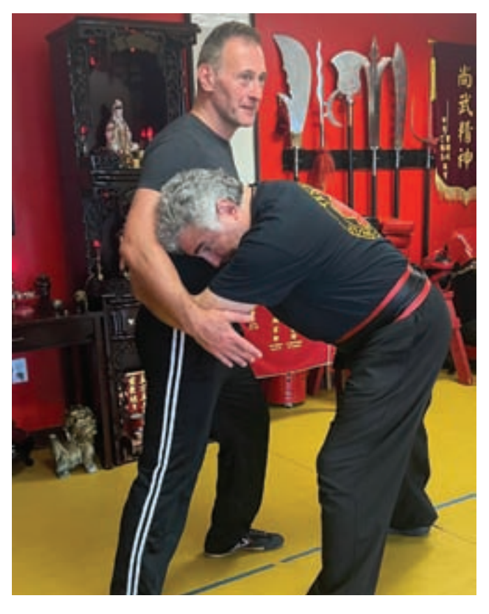
Pictures show page 28-29: an applications of cloud hands. Page 30 bend bow to strike tiger

"For example, if you're doing applications from the form and the person is taller or shorter the form will be higher'or lower but tai chi people spend a lot of time saying "no, the hand has to be exactly here or there'. You can become obsessed over the detail, instead of asking 'Why?. Well, this is going to hit someone's face,' so you are practising hitting something. Always come back to the form and say: 'Why is the hand there, what was the idea of that? What's open? What's mechanically efficient about it?' And then ask: 'Well in the real world if I can't get that position, how can I optimise it?'