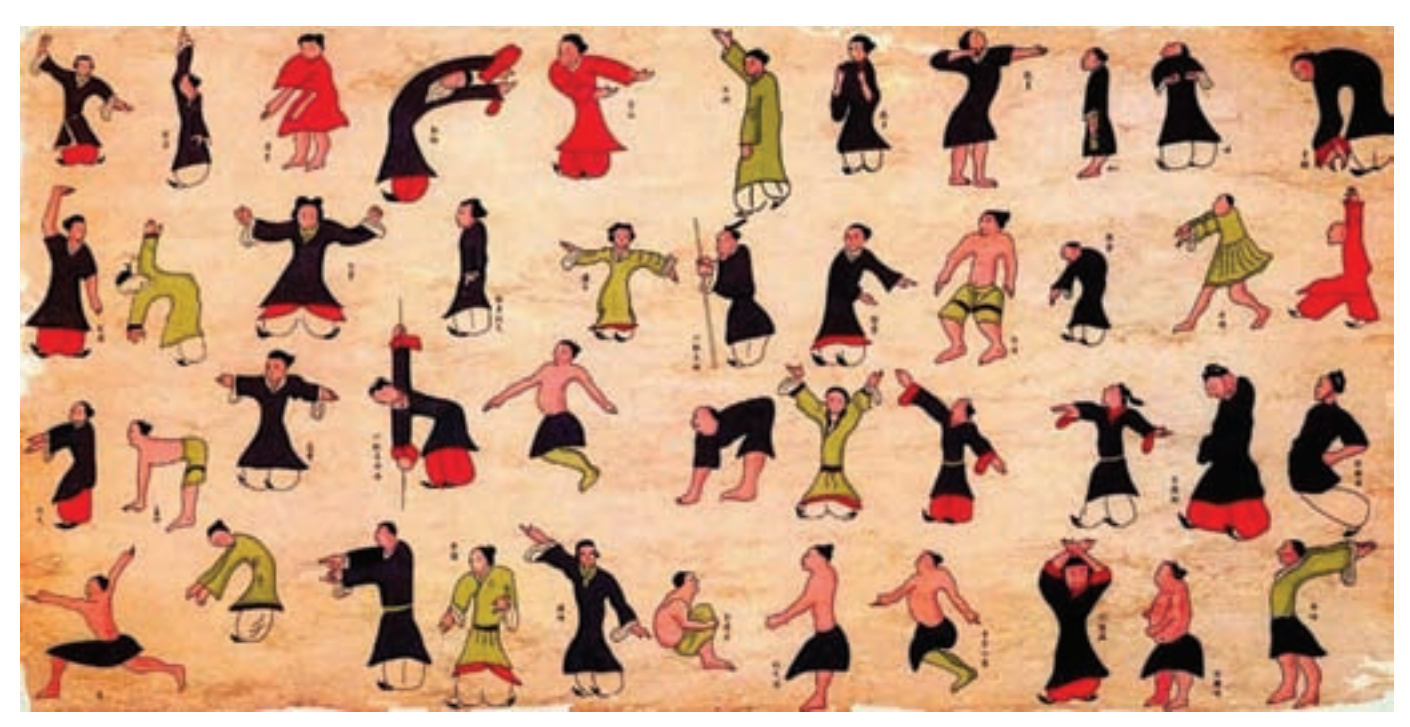
Copies of this chart of 44 qigong exercises now hang on the walls of qigong training centres all over the world. Its importance to qigong history is immense and many modern qigong routines are named after this chart

yaofang (Prescriptions Worth a Thousand in Gold) in which he introduced many therapeutic exercises based on qigong, notably a version of the liuzijue.