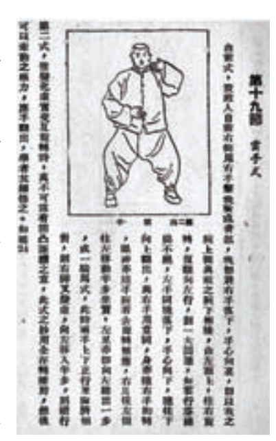
Figure 4b. Yáng style Cloud Hands.(cf. Chén Yánlín: Tàijíquán Zhenchuán 104-33)

To sum up: Chén Chángxing (1771 -1853)'s system is characterised by a of greater number forms, low postures, twining-silk energy (chánsijìng), leaps and explosive releases of power (fajìng). Yáng