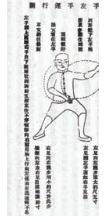
Figure 4a. Cloud Hands, Chén Xin ca. 1919.

In the human body, the most obvious manifestation of yin and yang's opposing yet complementary forces is in breathing, exhalation and inhalation, the interchange carbon-dioxide oxygen. Air, qì, as oxygen is carried by the blood through arteries and hairlike capillaries to nourish every cell in the body. This process is enhanced in qìgong, the cultivation of deep, slow and relaxed breathing in meditative stillness and mindful movement to boost the immune system, which is at the heart of tai chi practice.