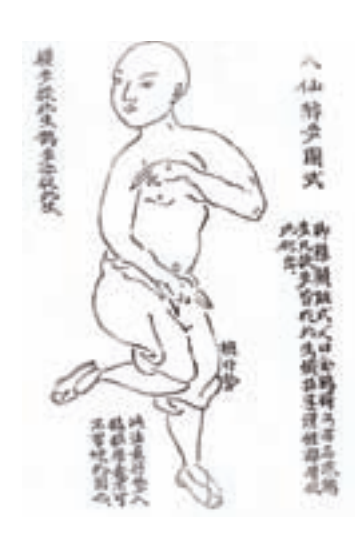
Figure 3a. Shàolín's Gold Cock on One Leg, a.k.a. Drunken Immortal Step, with Buddhist monk tonsure.

Z hang Héshàng, (Xuánji Kôngzhao: Quán Jing, Quánfâ Bèiyào. Shahar 2008: 122)